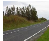
Sealed Country Road